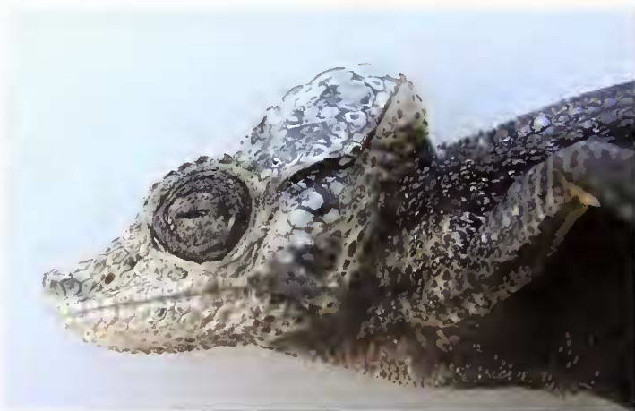
Fig. 4. Portrait of the holotype of K. u. artytor ssp. n..

Captive maintenance. All specimens were kept individually in full gauze terrariums indoor and outdoor in the same cages in order to minimize the stress of relocation. The size of the terrariums were for females 50x50x80 cm and for males 45x50x70 cm (length x width x height). All specimens were kept outdoor from spring to autumn, if the temperatures did not fall consistently below 10 °C at night time. The highest recorded temperature was 35 °C at noon, the lowest 5 °C at night time. The cages were exposed to the sun in the morning and fell into shade around